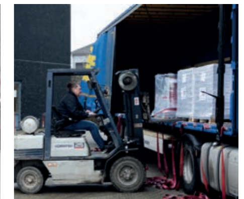
Valk Welding DK +45 64 42 12 01 info@valkwelding.com