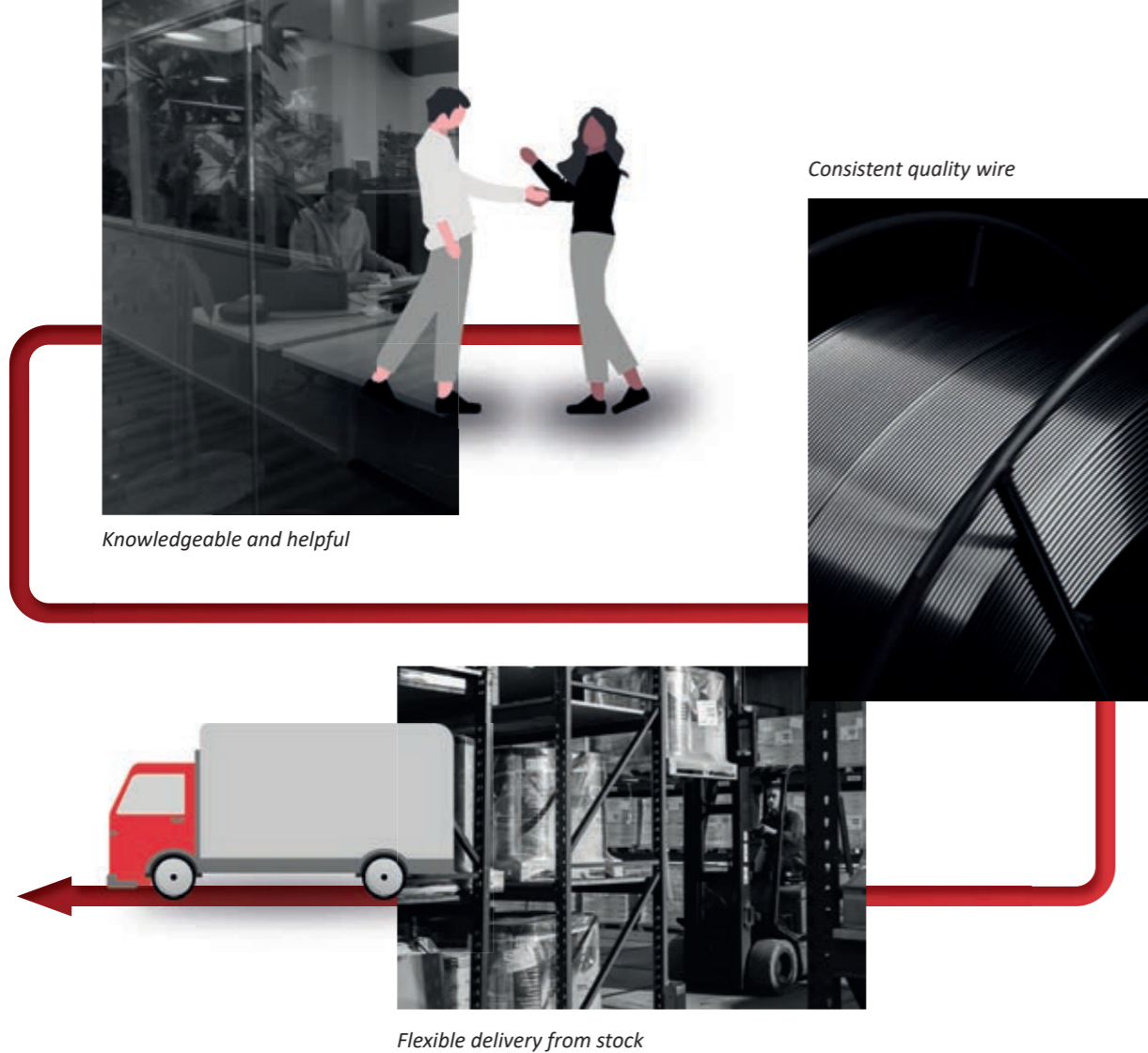
Knowledgeable and helpful