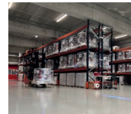
Valk Welding CZ +420 556 730 954 info@valkwelding.cz