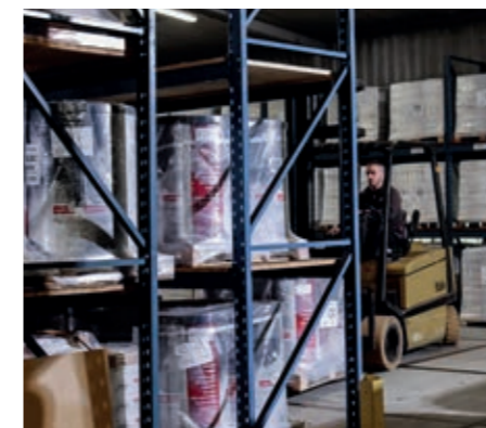
Valk Welding NL +31 78 69 170 11 sales@valkwelding.com